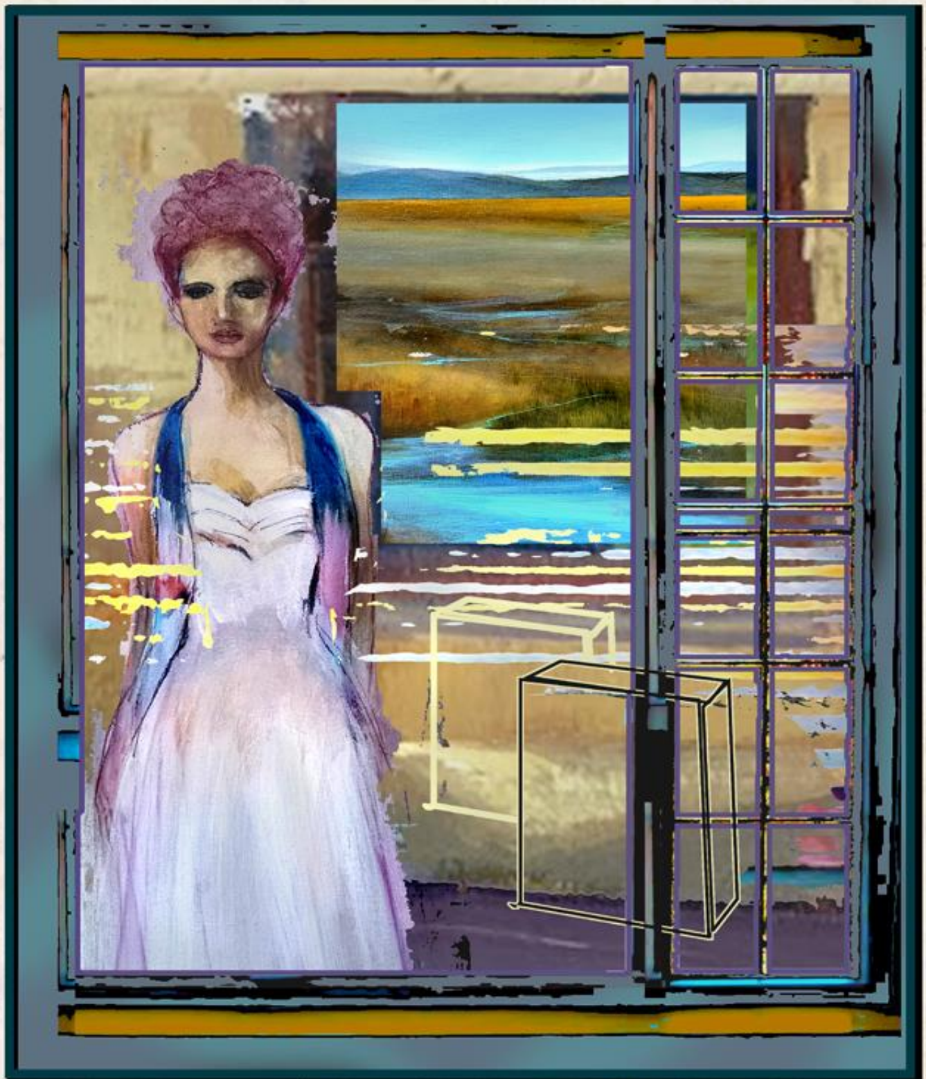
210816 Oil on Board 20 x 16

or as well as the isomorphic relationship and mirrored reflections between the basic structures of pataphysics and quantum physics; so it's easy to imagine an outline of coherence between these two very different enterprises. We can at least call that an interesting haptic synchronicity, or perhaps it's the zeitgeist, or better yet: a covalent topological expression of the tenor of our times; i.e. simply the outcome of both Alfred Jarry and Einstein breathing the same new rarefied non-Euclidian Twentieth Century airs;