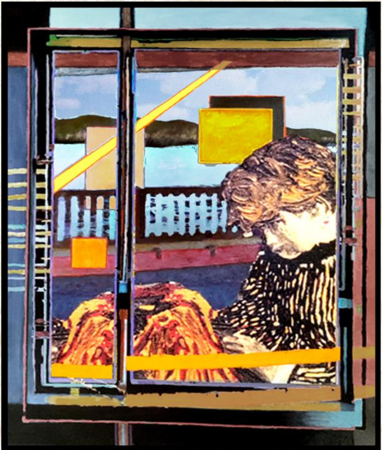
220523 Oil on Canvas 32 x 28

and for an advanced artificial machine-intelligence with hands and feet, vision, speech, etc., wandering around for a month; and then designing a proprietary personal identity from its agglomerated individual memories, as isomorphic as possible to what it can learn of contemporary human personal identity from studying ancient Vedas and the internet. Might a silicon simulacrum like that, or a silicon homunculus, experience something isomorphic to a human self? We might assume it would inferentially demaculate but if the